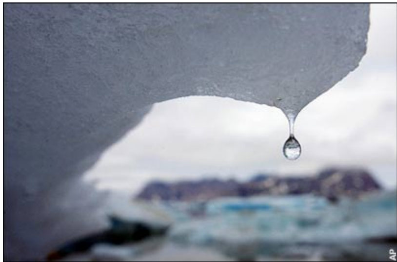
The melting of Himalayan glaciers threatens the water supply to the world's rivers

A Goldman Sachs report said water was the "petroleum for the next century", offering huge rewards for investors who know how to play the infrastructure boom. The US alone needs up to $1,000bn (£500bn) in new piping and waste water plants by 2020.